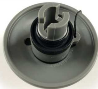
Image 2. airCap HR Seal Flipped