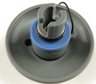
Image 3. Use of Valve Cap Seal